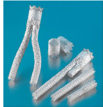
Image 2: Examples of stents used in Aortic Endovascular Repair (EVAR) procedure.

Implanted devices such as stents are required to function for a long period in a hostile environment. Durability testing is key to proving that performance does not decay in-vivo . This involves pulsing a number of stents (within artificial vessels at body temperature) at an accelerated rate. Simulating conditions in the body, whilst giving quicker feedback on performance. Typically 10 years use is simulated over 400 million cycles. The product under test is periodically examined under the microscope to identify any early signs of fatigue and any particles released are trapped for analysis. Following fatigue testing a full examination of mechanical and surface properties is carried out including electron microscope analysis. Mechanical testing includes a comparison of tensile strengths, burst resistance and crush resistance before and after use.