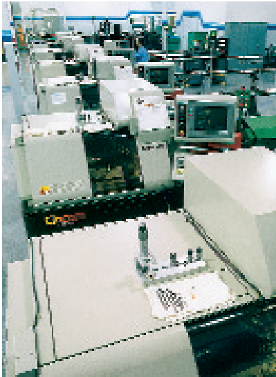
Multi-axis Swiss machining showing typical cutting tools.

Debris is sucked into the nozzle. Blockage of the catheter is prevented by the use of a turbine in the nozzle to finely chop the debris. This turbine has four accurately defined blades with a total diameter of 1.5 mm. Production problems and potential solutions for producing the IVTRRC are shown in Table II.