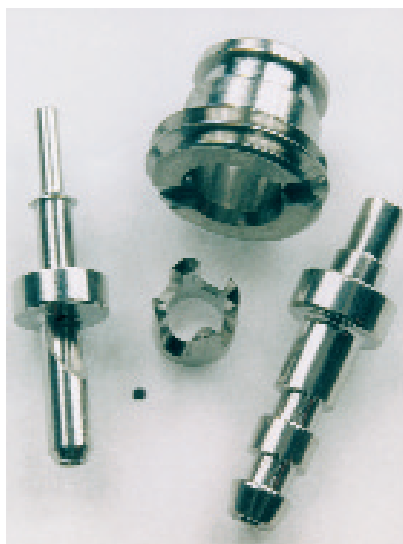
Fluid-handling microcomponents, the black dot is a 10-point full stop.

Because of the need to safeguard commercial secrets, a fictitious example of an intravascular tumour removal and repair catheter (IVTRRC) is used to demonstrate current